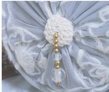
9129 Beaded Rosette