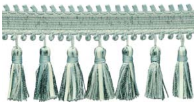
8328 Ribbon Tassel Fringe