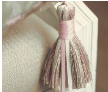
99153 Ribbon Cushion Tassel