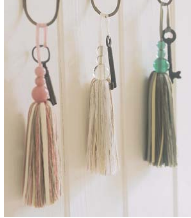
9128 Beaded Ribbon Key Tassel