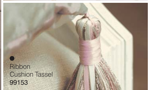
● Ribbon Cushion Tassel 99153