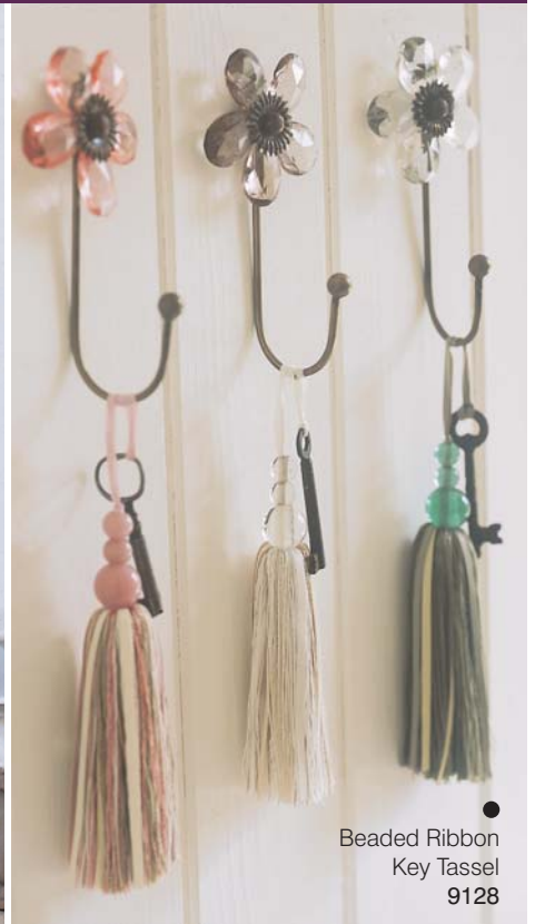
● Beaded Ribbon Key Tassel 9128