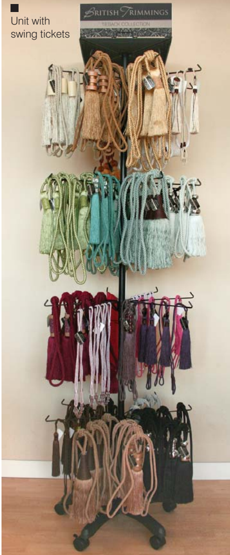
Unit with swing tickets